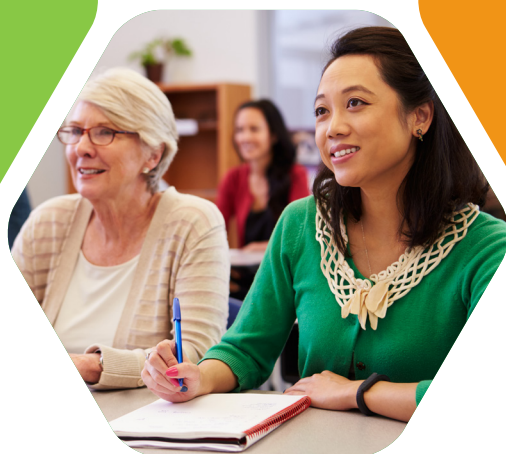
Table 3 on the following pages describes some of the roles in early childhood education, general descriptions of the work, educational requirements, and some of the benefits and challenges for early childhood professionals.

There are a variety of positions available to work in early childhood education. There are positions that allow work from home, in child care centers or Head Start programs, and in public school settings. One can also choose to focus on a specific age of children they prefer. There are some early childhood caregivers who prefer to work with just infants and toddlers. They often will work in an infant/toddler classroom in a child care center or dedicate their family child care home to serving infants and toddlers. Other professionals work in home visitation programs or Early Head Start programs.